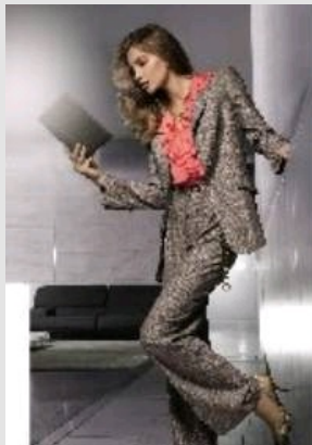
Wool/silk blend jacket, £269, ruffle blouse, £69 and wool/silk blend trousers, £139 all Elegance

Forget the nine-to-five, finding a hard-working wardrobe to suit your lifestyle can turn into a full-time occupation. Jayne Dawson puts workwear on the fashion agenda